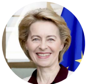
Ursula von der Leyen