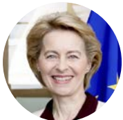
Ursula von der Leyen